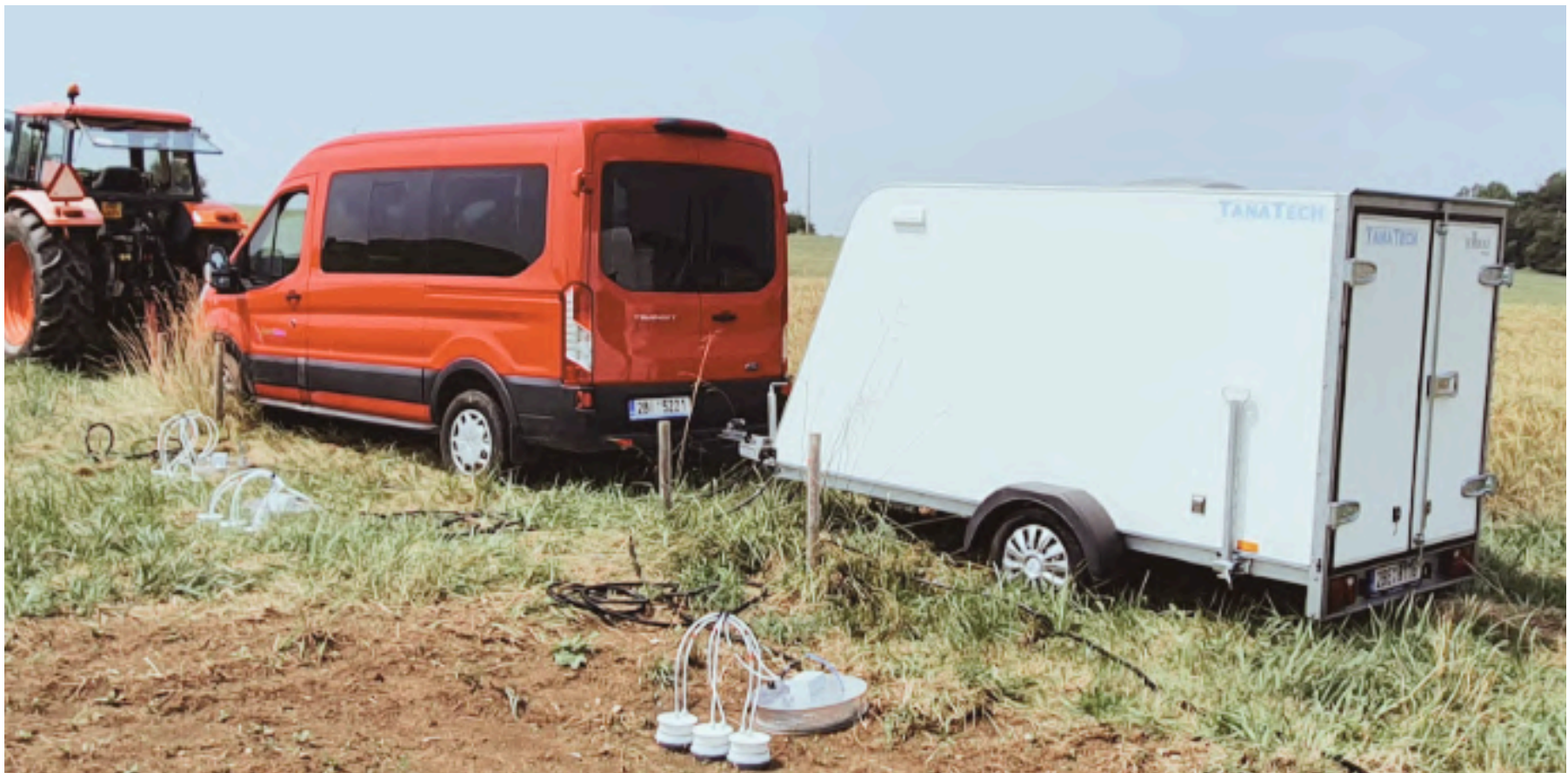
Measurement of greenhouse gas emissions using manual chambers and a mobile platform for variations of repeated disturbance and fertilisation in a grassland ecosystem