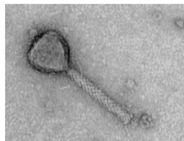
Transmission electron microscopy image of MATE 2 showing a particle with an isometric capsid head and a long contractile tail, scale bar = 25 nm

A series of publications, highlight the latest advancements in this field at Analyst platform of CIHEAM Bari, underscoring their effectiveness as natural solutions for combating plant pathogens while minimizing environmental impact.